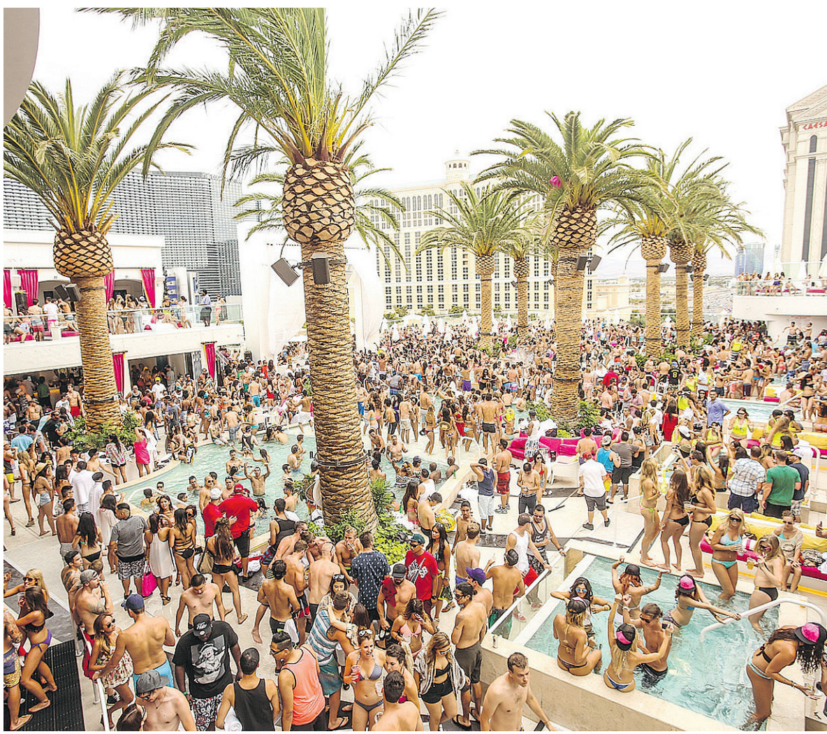
Drai's Beach Club & Nightclub at The Cromwell Las Vegas is the ultimate party place, day or night. After dark on weekends, the area explodes into a bacchanalian, multi-sensory party.

The guest rooms have a boudoir look, with tufted Art Nouveau sofas and tables and dressers that are studded, like vintage steamer trunks. And, fabulous art pho-